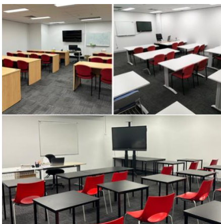
Classrooms at ACCHS (Parramatta Campus)