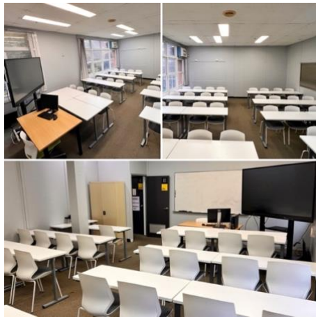
Classrooms at ACCHS (Sydney City Campus)