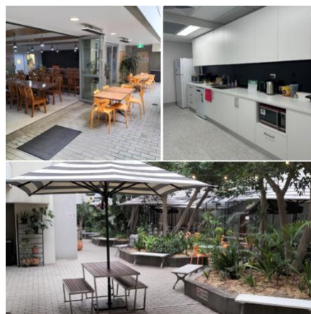
Related Facilities (Parramatta Campus)